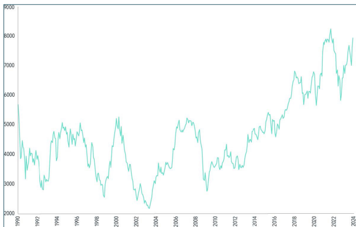
Exhibit 3 Land of the Rising Stock

After decades of lagging behind, Japan has lately been a bright spot in global markets. From 1990 to 2022, Japan saw its share of the global market cap decline from 40% to 6%. 13 But since September 2022, Japan has posted a return of 28.1%, with stocks there nearing an all-time high (see Exhibit 3).